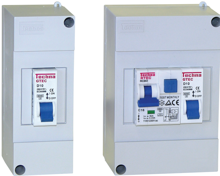
MCBs supplied separately

Techna's Dtec Circuit Breaker Enclosures are manufactured from rugged self-extinguishing materials and are equipped for top, bottom or rear cable entry for maximum ease of use.